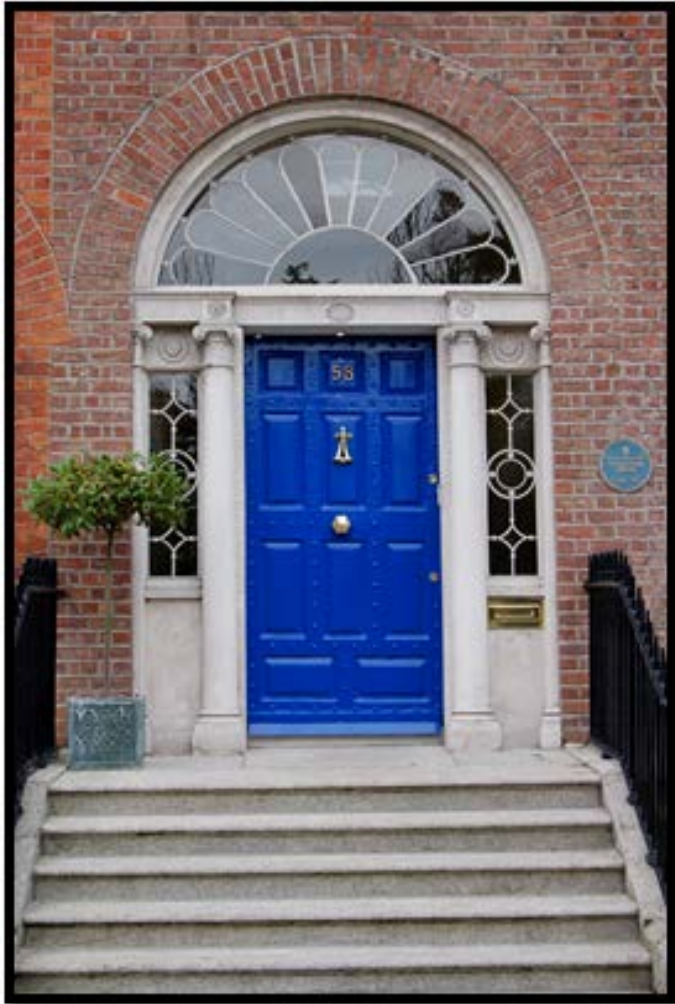
O'Connell House, Dublin